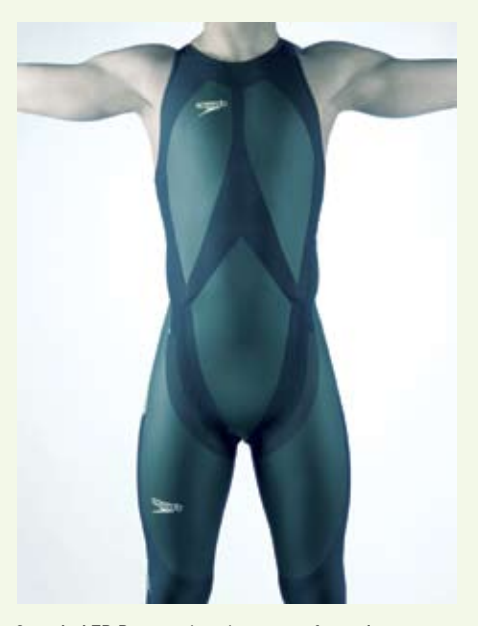
Speedo LZR Racer swimsuits out-performed expectations at the CN Swim Trials in Montréal, QC.

To a consumer concerned about environmental degradation, the heralding of organic cotton fibres for athletic garments is a step forward. Mountain Equipment Co-operative, manufacturer and retailer of athletic clothing in Canada and abroad, has been a leader in the movement to "go organic" in cottons. In the last few years, they have converted all their MEC-brand cotton clothing to an organically grown alternative. In 2005, they were among the top 25 global buyers of organic cotton fibre. They purchased 129,300 kg of raw material in that year and boasted about their avoidance of the use of 42,600 kg of synthetic fertilizers, pesticides and defoliants as a result. Other corporations are looking into